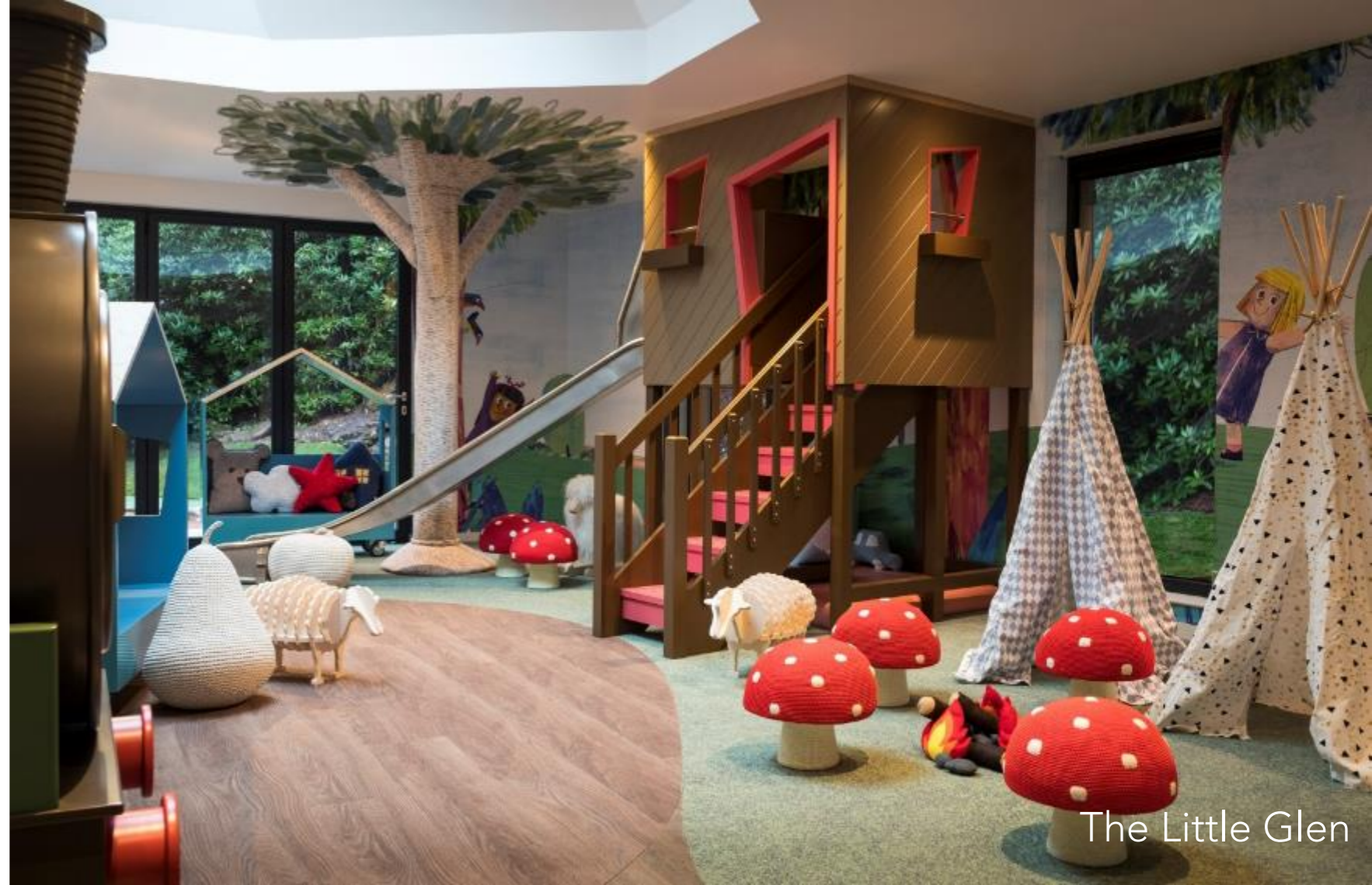
The Little Glen